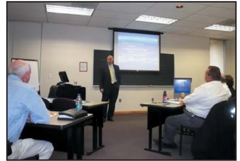
Another region #7 conference workshop.