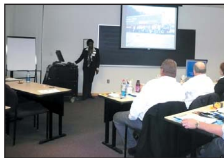
A region #7 conference workshop.